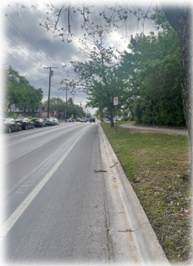
Figure 1 Drop Off

For pick-up buses can stage further back along West Hickory Street west of the greenhouse. When the school groups gather at the bus stop, we will have the buses pull forward for loading.