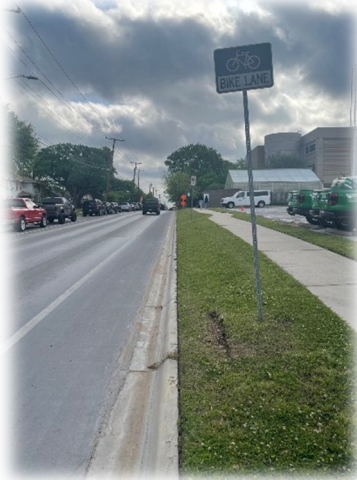
Figure 2 Staging Area

For pick-up buses can stage further back along West Hickory Street west of the greenhouse. When the school groups gather at the bus stop, we will have the buses pull forward for loading.